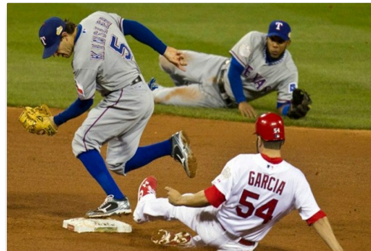
Game two World Series Web Gem

and thanks to Imovie I put a fun video up on my website .