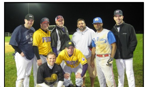
Nyack teammates together again

The time sharing with Woman's Volleyball & Basketball teams was very interesting as I sensed the internal voice of the Holy Spirit telling me only to bring the Solarium Cards which are about fifty different pictures of people and objects. The Solarium is a great ice breaker and helps people use pic-