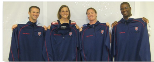
2011 Nyack College Athletic Hall of Fame Inductees