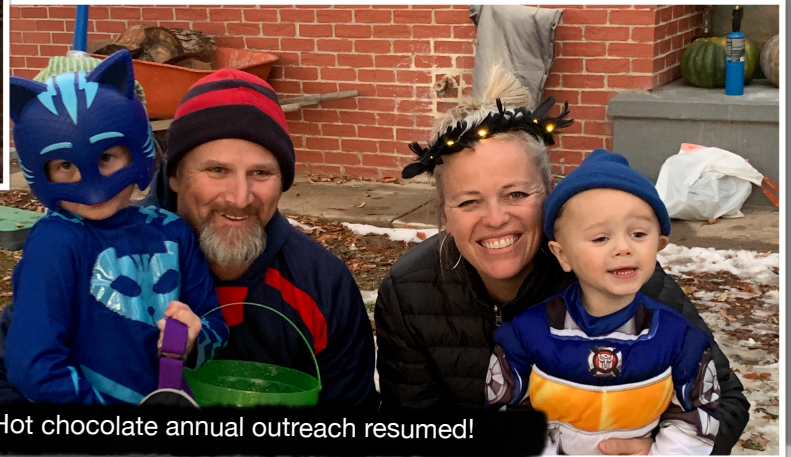
Hot Dogs and Hot chocolate annual outreach resumed!

MOLD 2GOLD OCTOBER BASEMENT FINISHED (1 OF 2) 20 FT CONTAINER EMPTIED INTO THE BASEMENT SETTLED AND MOVED BACK INTO BASEMENT FINAL FLOORING INSTALLED NOV 21ST HOPE TO CLEAN STUFF EMPTY (2 OF 2) 20 FT CONTAINERS DURING THANKSGIVING/CHRISTMAS RAISED $95 K OF $400K MINIVAN GENEROUSLY DONATED TO HARGROVES!!!!